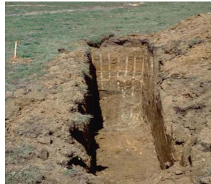
Figure 7.7 – Deep Hole Excavation

per hour too slow; rather, this means that infiltration will occur slowly over a two- to three-day period, which is ideal for water quality improvement.