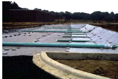
Figure 7.5 – Perforated Pipes