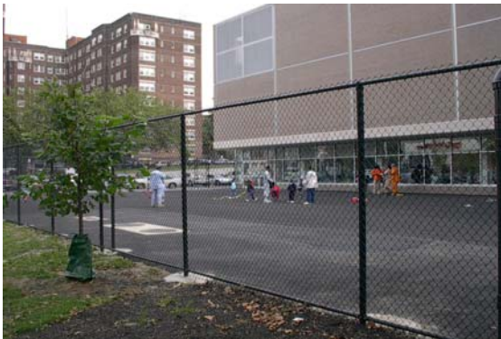
Figure 7.11 – Porous Playground

and an urban playground at the Penn New School in Philadelphia (Figure 11). At Swarthmore College, the paths are not part of an infiltration bed but are merely intended to reduce impervious cover. The Penn New School project works to reduce the volume of stormwater discharging to the Philadelphia combined sewer overflows. Both of these applications are “retrofits” in urban areas that were previously paved.