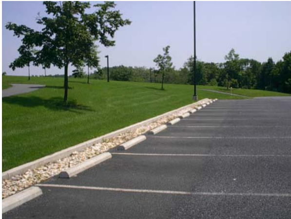
Figure 7.6 – Repaved, Unpaved Stone Edge

We have also taken the “belt and suspenders” approach to all of our systems. If the pavement were to be paved over, forgotten, or clogged, stormwater still must reach the stone bed below the pavement. Often, we have used an unpaved stone edge, as shown in Figure 6, for this purpose. We have also used catch basins that discharge to perforated pipes in the bed.