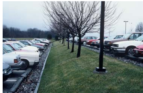
Figure 7.3 – Benched Parking Bays

Constructed in 1983 as part of the Shared Medical Systems (now Siemens) world headquarters, the system consists of a series of porous pavement/recharge bed parking bays terraced down the hillside connected by conventionally paved impervious roadways. Both the top and bottom of the beds are level, as seen in Figure 3, hillside notwithstanding. After twenty years, the system continues to function well and has not been repaved. Although this area is naturally prone to sinkholes, far fewer sinkholes have occurred in the porous asphalt areas than in the conventional asphalt areas, which the site manager attributes to the broad and even distribution of stormwater over the large areas under the porous pavement parking bays.