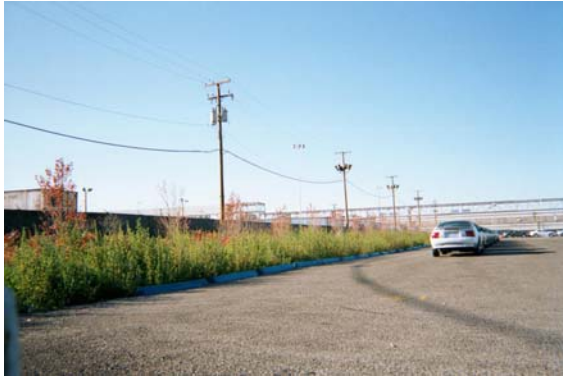
Figure 7.8 – Mustang Lot

The stormwater stored in the beds beneath the porous pavement supports the vegetated swales by discharging slowly to the planted areas. The system is specifically designed to improve water quality. Referred to as the “Mustang Lot” (because new Ford Mustangs are parked there after assembly), the lot has worked well, and current Ford plans include the construction of additional areas of porous pavement areas that will drain to constructed stormwater wetlands.