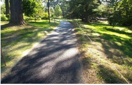
Figure 7.10 – Porous Asphalt Walking Paths

and an urban playground at the Penn New School in Philadelphia (Figure 11). At Swarthmore College, the paths are not part of an infiltration bed but are merely intended to reduce impervious cover. The Penn New School project works to reduce the volume of stormwater discharging to the Philadelphia combined sewer overflows. Both of these applications are “retrofits” in urban areas that were previously paved.