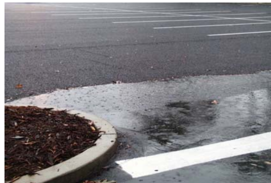
Figure 7.1 Water Pass

First developed in the 1970s at the Franklin Institute in Philadelphia, porous asphalt pavement consists of standard bituminous asphalt in which the aggregate fines (particles smaller than 600 um, or the No. 30 sieve) have been screened and reduced, allowing water to pass through the asphalt (Figure 1).