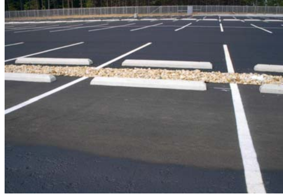
Figure 7.12 – Large Commuter Parking Lot

Although we have used other materials such as porous concrete for both sidewalks and parking areas, the asphalt is less expensive and easier to install, and it remains our first choice. Even in hot Southern climates, such as the University of North Carolina in Chapel Hill (Figure 12) where two large commuter parking lots have recently been installed, the porous asphalt has performed quite well.