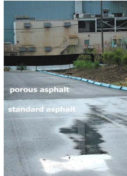
Figure 7.9 – Porous & Standard Lot Sections